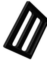
# OBE to # OBH