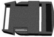
# OBA to # OBD